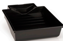
Paint tray made with 100% Recycled PP

Please contact your Milliken representative for any additional information.