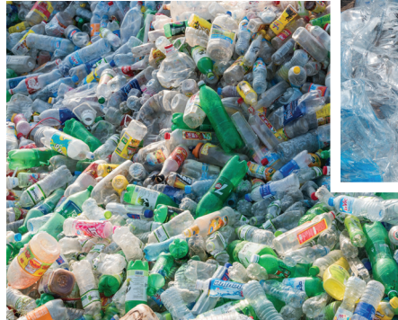
Colored PET recycle stream

By enabling greater use of more natural and uncolored PET, ClearShield helps to reduce or eliminate the need to use dark or colored containers to protect the contents. Such opaque and colored PET materials tend to make the recycle stream dark, which can make recycling more difficult and lessen the value of the reclaimed product. All this only further strengthens the argument for using clear, uncolored PET, and ClearShield UV Absorber allows this to happen, with no compromise in product quality.