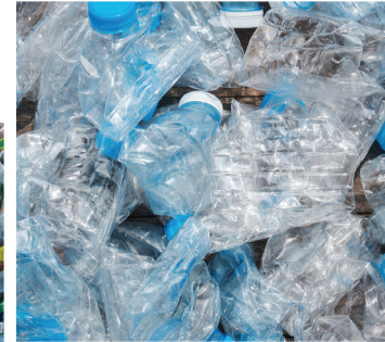
Uncolored PET recycle stream

“Plastics Recyclers Europe trade group warns These ‘colorful’ future trends will weaken the image of PET as a recycled product”