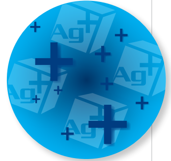
Treated with AlphaSan Exposure to silver ions kills bacteria